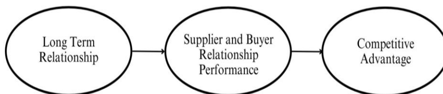
Figure 1. Research model

Satisfaction is the pleasurable sensation or disappointment that arises in an individual after comparing perceptions or responses to the performance or outcome of a product with their expectations (Hanafi et al., 2019). Satisfaction is also a result of responses or perceptions of performance and expectations. The closeness of the buyer-supplier relationship begins with the satisfaction derived from the relationship (Bag, 2018). Supplier satisfaction impacts the sustained relationship between buyers and suppliers (Glavee-Geo, 2019). Hanafi (2019) differentiates satisfaction into two categories: Economic satisfaction refers to satisfaction that arises from the economic aspects of the business partnership, such as sales volume, margins, and discounts. This defines economic satisfaction. Non-economic satisfaction is defined as a positive psychological response to the relationship. Non-economic satisfaction can also be interpreted as characteristics that are not visible in a business relationship.